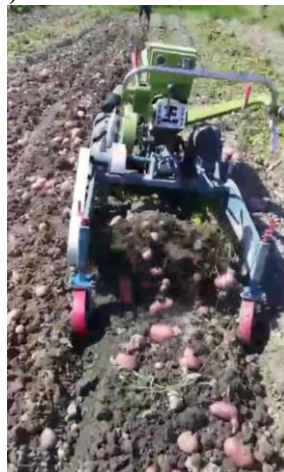
Figure 4 – The operation of the potato-digger

Also, the implementation of research tasks provided for the determination of agro-technical indicators (losses and damage to potato tubers) of the work of a motor-block potato digger (Fig. 4).