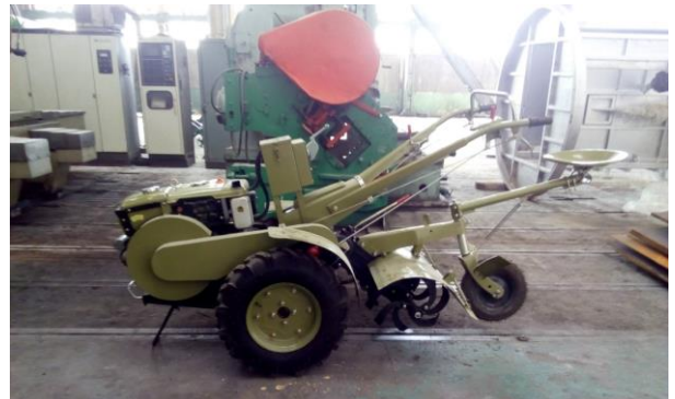
Figure 2 - Selected walk-behind tractor

Technical characteristics Caliber TDK-12