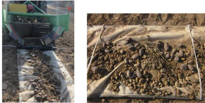
Fig. 3: Blade with not-separated mass

We have developed and manufactured undulating rippers with various parameters for the experimental research. A multivariate experiment was implemented to determine the rational parameters of the swathing device.