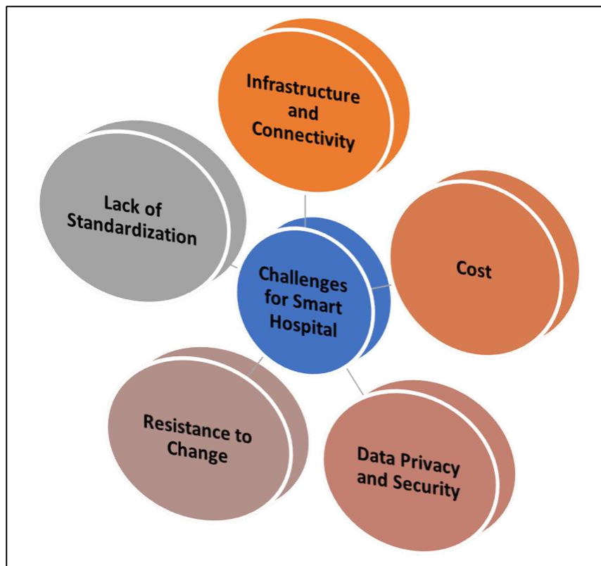
Figure 1: Challenges faced by Smart Hospitals in India

Despite the many benefits of Smart Hospitals in India, there are several challenges that hospitals and healthcare providers are facing in their adoption of digital technology as shown in figure 1. Some of the key challenges faced by Smart Hospitals in India include: